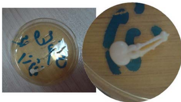
Figure 3. Culture media of Sabouraud agar showing Candida albicans colonies