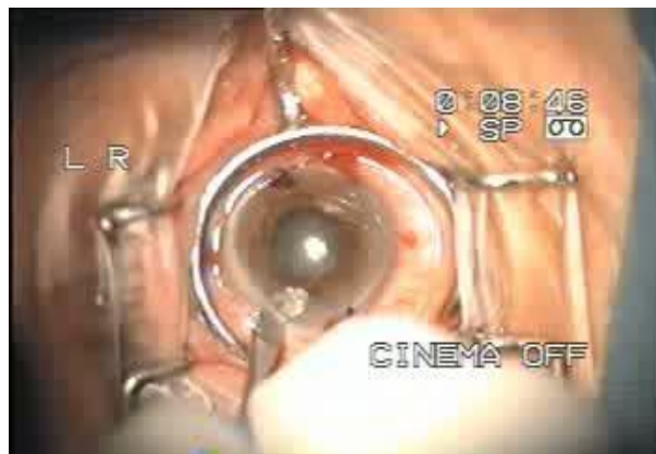
Figure 1. All LRIs were placed inside the surgical limbus at a depth of 600 µm before phacoemulsification with the LRI knife determined for 600 µm as shown in this figure.